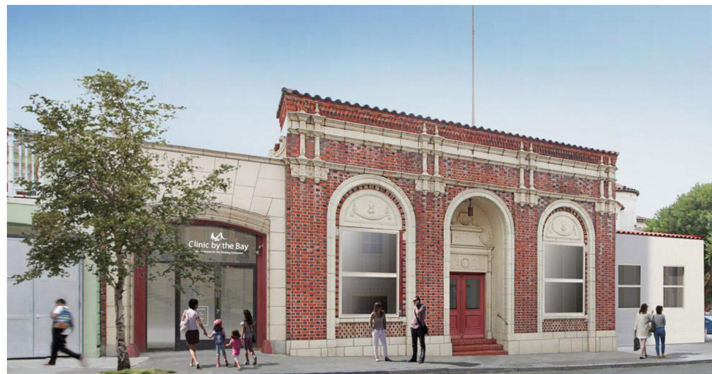
Clinic by the Bay's new facility at 35 Onondaga Street, site of the historic Alemany Emergency Hospital.

In addition to offering high-quality primary care, the clinic plans to expand services in its new location by offering dental care, extended hours, and a free pharmacy.