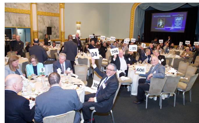
Luncheon guests bid enthusiastically on live auction items.