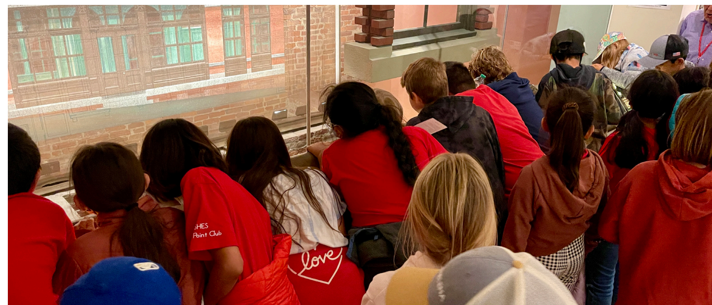
A visiting school group takes a peek at the brick vault on the Museum's lower level.