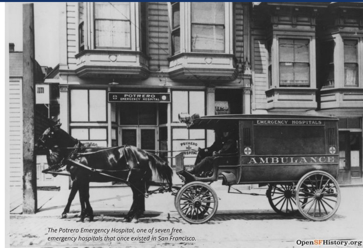
The Potrero Emergency Hospital, one of seven free emergency hospitals that once existed in San Francisco.