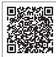
(Scan this QR code with your smart phone to watch the video.)

In keeping with the spirit of remarkable women, the luncheon program also honored young women leaders of tomorrow. Our 11 high school interns from Cristo Rey Academy attended the luncheon as teen ambassadors. And, the 2023 first-place Fracchia Prize winner spoke about why it is important for young people to understand our city's history and what they can learn from the leaders who have come before.